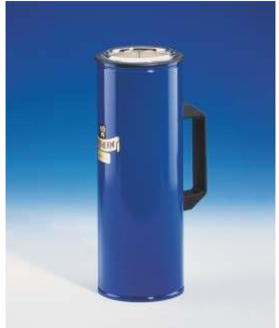
Dewar flask G 9 C